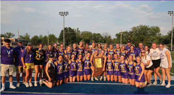
2023 GIRLS LACROSSE CLASS 2A STATE CHAMPIONS