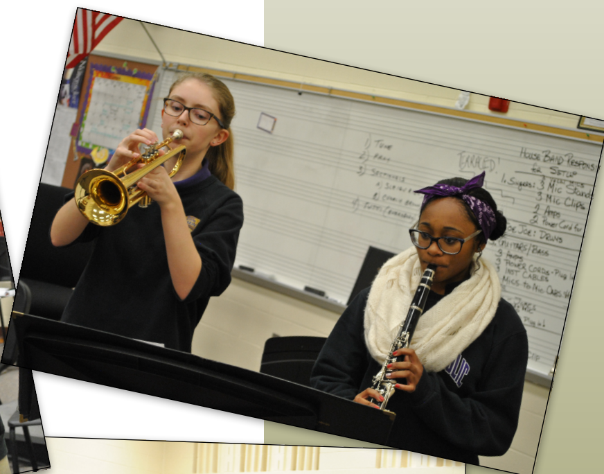
Member of the jazz band prepare for the Christmas Concert during a Wednesday morning rehearsal