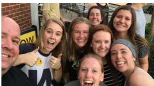
GC Alumni College visits at the University of Dayton (top) and Purdue University (bottom) in 2016-17.