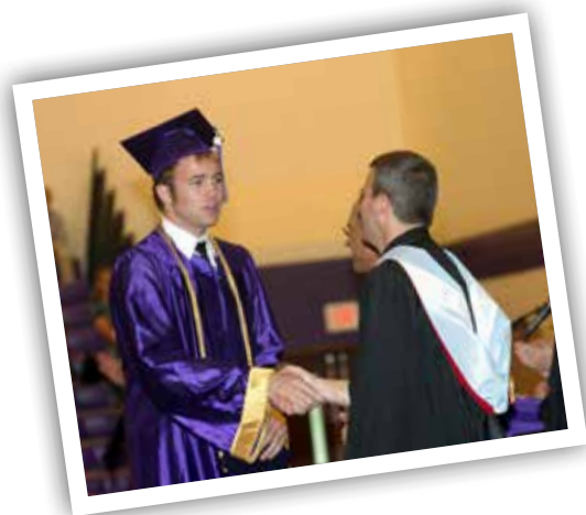
Guerin Catholic Class of 2008

Bachelor of Arts in Political Science, Wittenberg University Class of 2012