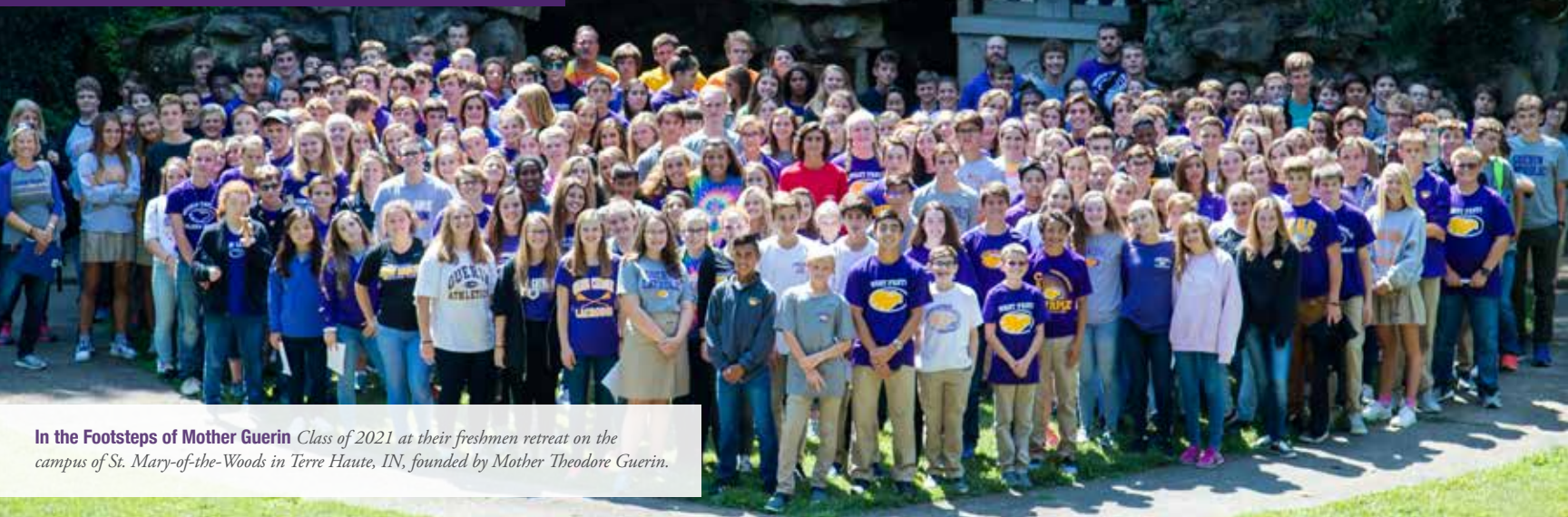
In the Footsteps of Mother Guerin Class of 2021 at their freshmen retreat on the campus of St. Mary-of-the-Woods in Terre Haute, IN, founded by Mother Theodore Guerin.