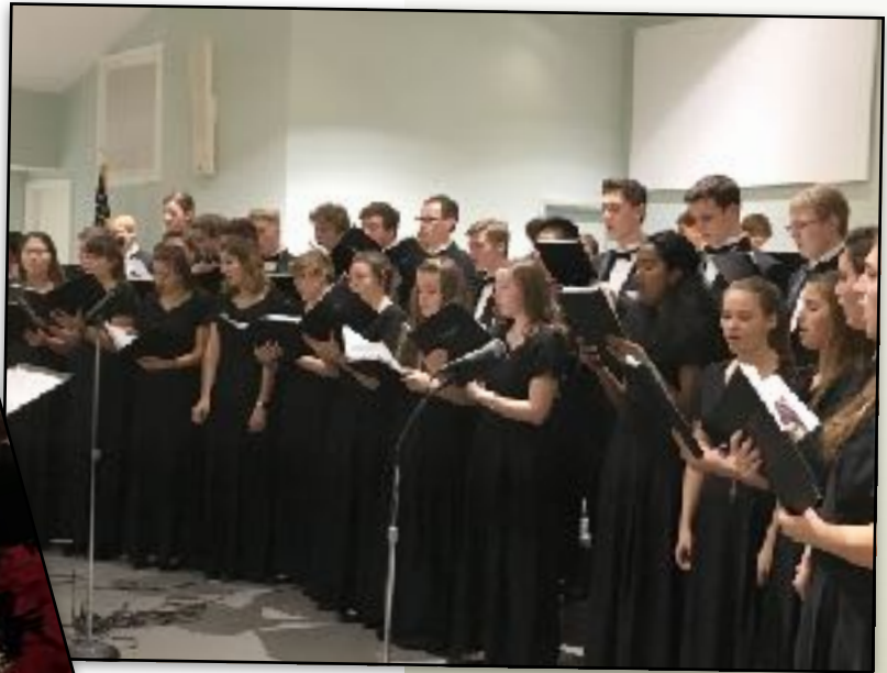
GoldenVoice and Concert Band cheered residents of Hoosier Village during an evening performance December 6.