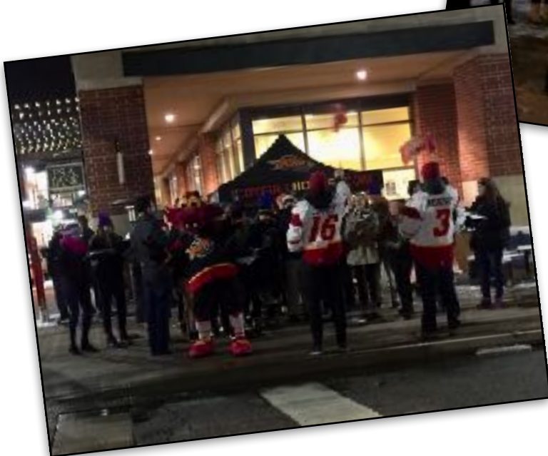
Sounds of Providence caroled in the cold at Clay Terrace December 13. Left: The mascot for the Indy Fuel hockey team joined in the festivities.