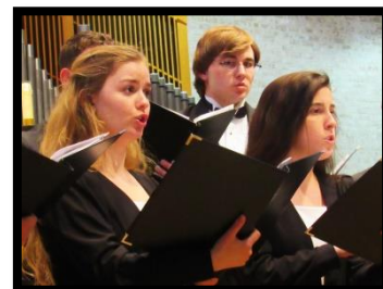
Sounds of Providence