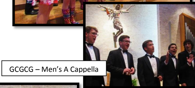
GCGCG – Men's A Cappella