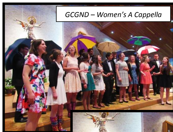
GCGND – Women's A Cappella