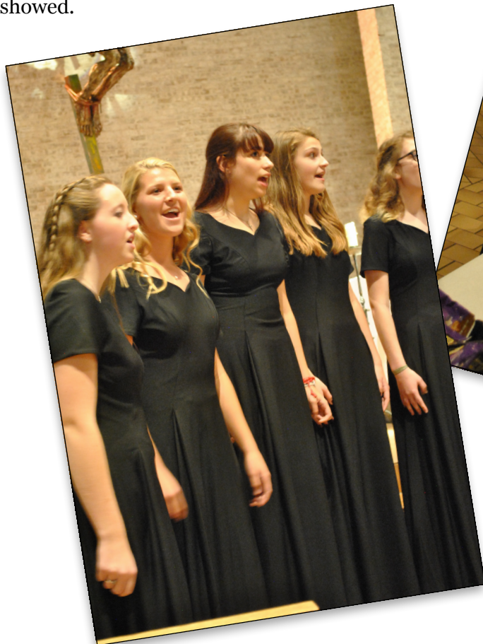
(top: GCGCG presents a mash-up of "I'm Yours" and "Somewhere Over the Rainbow"; left: GCGND members entertain; above right: guests enjoy refreshments at the pre-show reception)