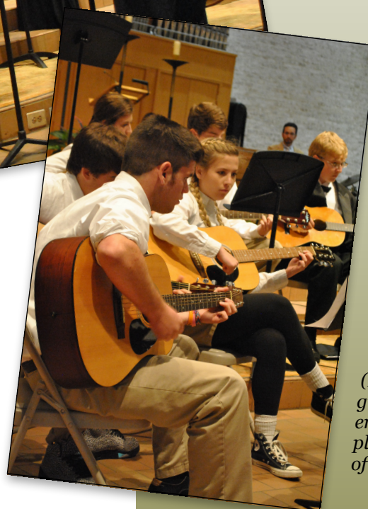
(Left: the guitar ensemble plays “Heart of Gold”)