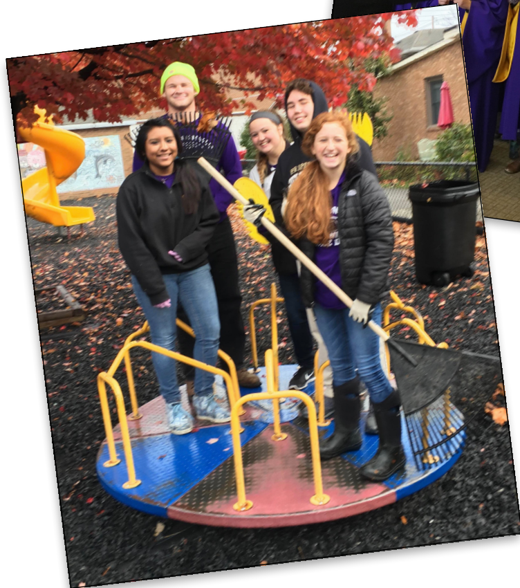
(top: Sounds of Providence sings for residents of Hoosier Village; middle: GoldenVoice fills the halls of St. Vincent Fishers with Christmas carols; left: music students rake the playground at St. Mary's in Anderson on Guerin Catholic's annual service day)