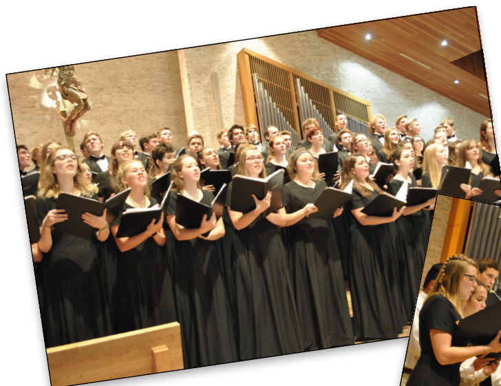
(Members of GoldenVoice, left; Beginning and Intermediate Chorus, below)