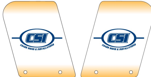
Example of 4"x7" bleacher end caps