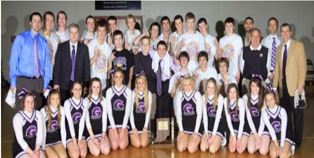
In their six years of varsity competition Guerin Catholic High School has already enjoyed success. They have averaged over 17 wins a season. The Golden Eagles were Regional Finalists in 2010 (pictured above) and captured the school's 1 st IHSAA State Championship in any sport this past season (pictured below).