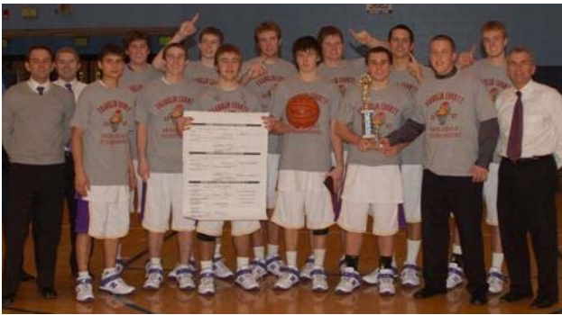
The first team to win a tournament in 2007 at Franklin County